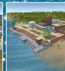
MADHU SUDAN COLONY/ CREMATION GHAT