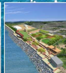
SINGI DALAN GHAT