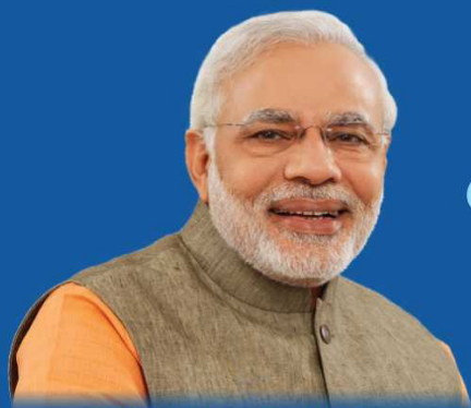
Shri Narendra Modi Hon'ble Prime Minister