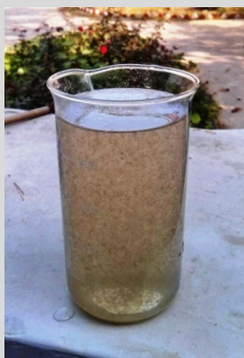
Sludge separates from sewage water to which ECOCLEAN-20 has been added

ECOCLEAN-20 used in combination with ECOSD-P (a Poly electrolyte compound), is an ideal organic coagulant and flocculating reagent for separating dissolved and suspended solids and removing colour and mal-odour from sewage, dying unit effluents and industrial effluents. It causes the sludge to sediment, leaving the upper water crystal clear. The sludge, unless contaminated with chemical toxins, would constitute an effective fertilizer. ECOCLEAN-20 is a combination of water soluble cationic polymers and herbal additives formulated in the form of a hydrated solution. It is a cationic coagulant for clarification of water (see detailed product description).