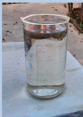
Crystal clear sewage water, 20 minutes after treatment with ECOCLEAN-20